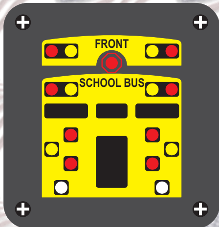
RCT-01729-00000 Indicator Panel, Use With RCT-01727-A Only.